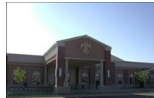
View of West Entrance – Scottish Rite Temple (Learning Center)