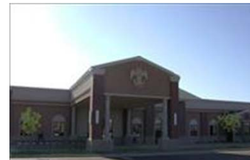
View of West Entrance – Scottish Rite Temple