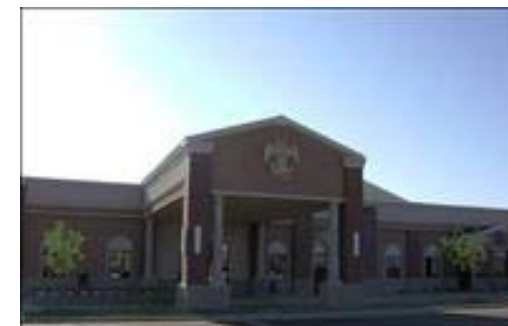
View of West Entrance – Scottish Rite Temple (Learning Center)